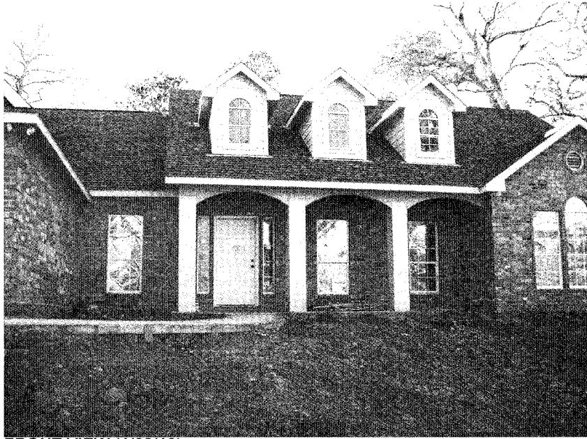
FRONT VIEW (1/22/10)