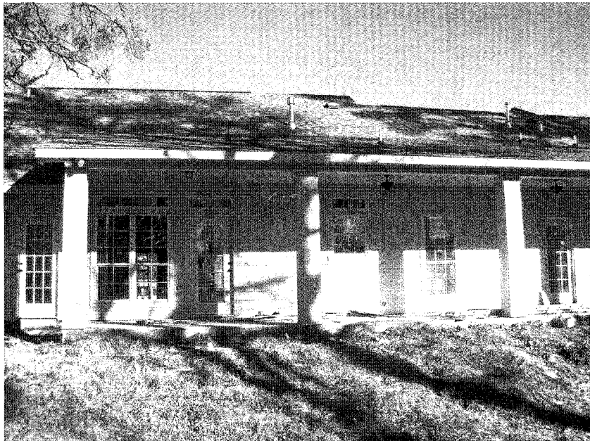
REAR VIEW (1/22/10)