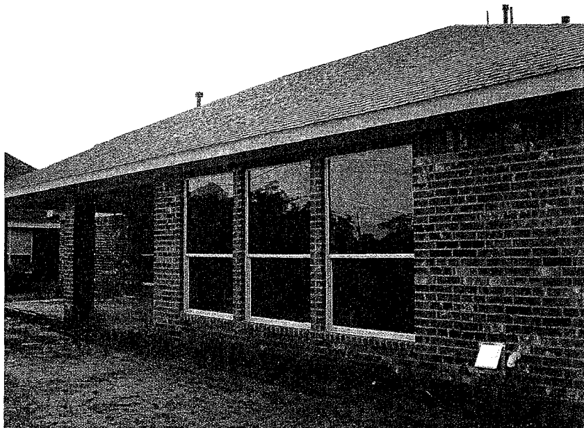
REAR VIEW (9/19/07)