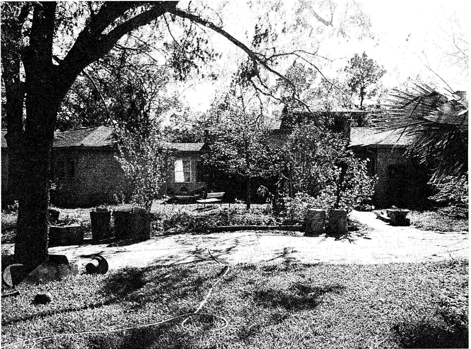
FRONT VIEW OF RESIDENCE

FINISHED FLOOR OF RIGHT HAND SIDE ELEV = 5.5' FINISHED FLOOR OF LEFT HAND SIDE ELEV = 5.9'