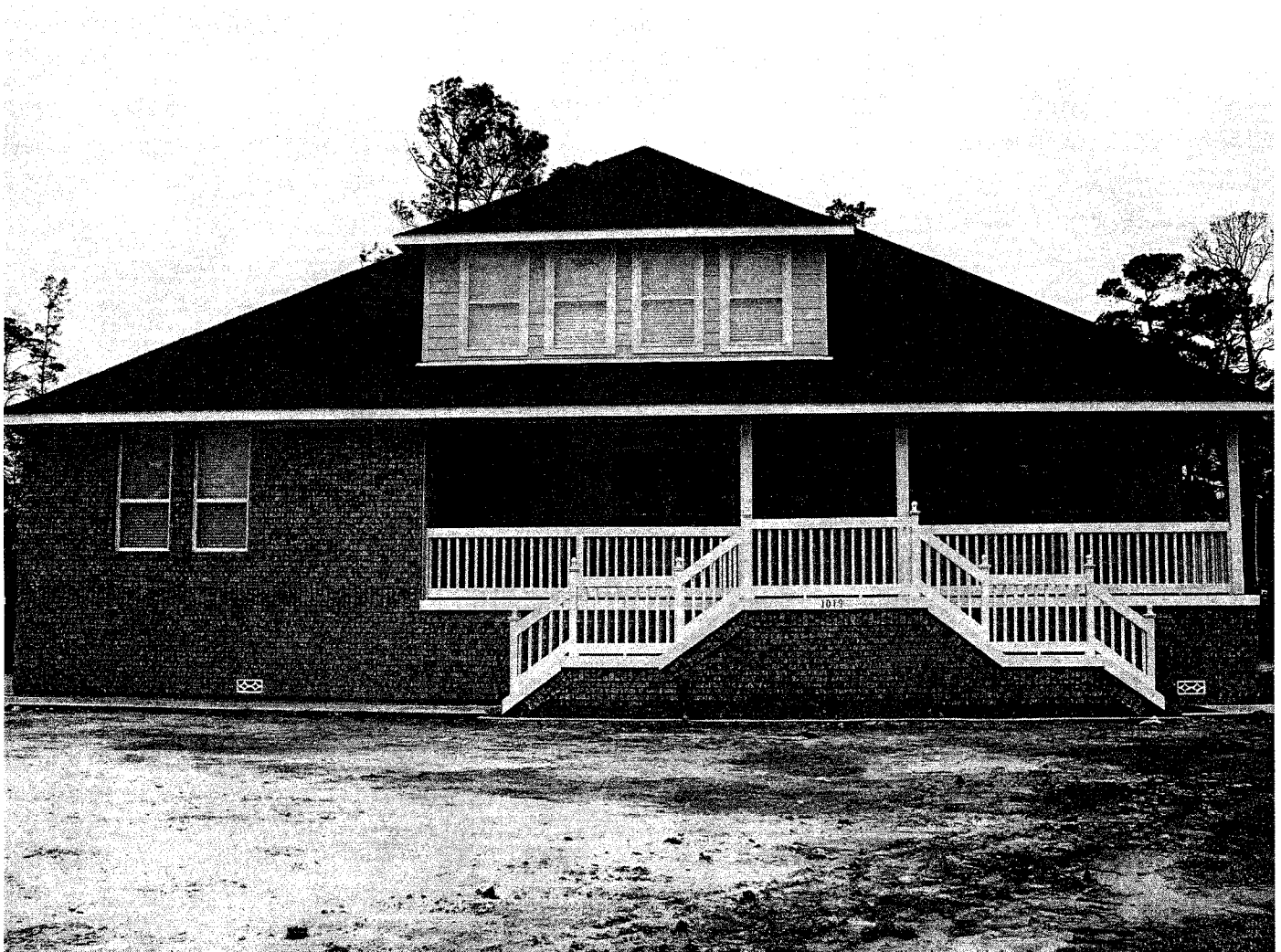
FRONT VIEW OF RESIDENCE