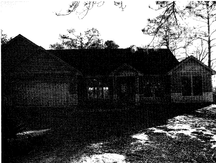
FRONT VIEW (1/6/11)