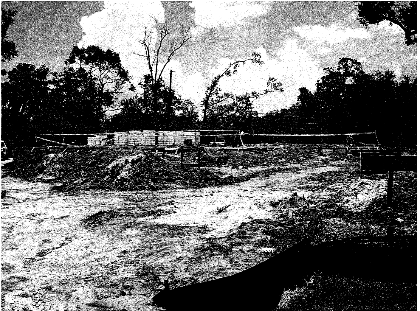
Front view Form elevation 12.7'

If using the Elevation Certificate to obtain NFIP flood insurance, affix at least two building photographs below according to the instructions for Item A6. Identify all photographs with: date taken; "Front View" and "Rear View"; and, if required, "Right Side View" and "Left Side View." If submitting more photographs than will fit on this page, use the Continuation Page, following.