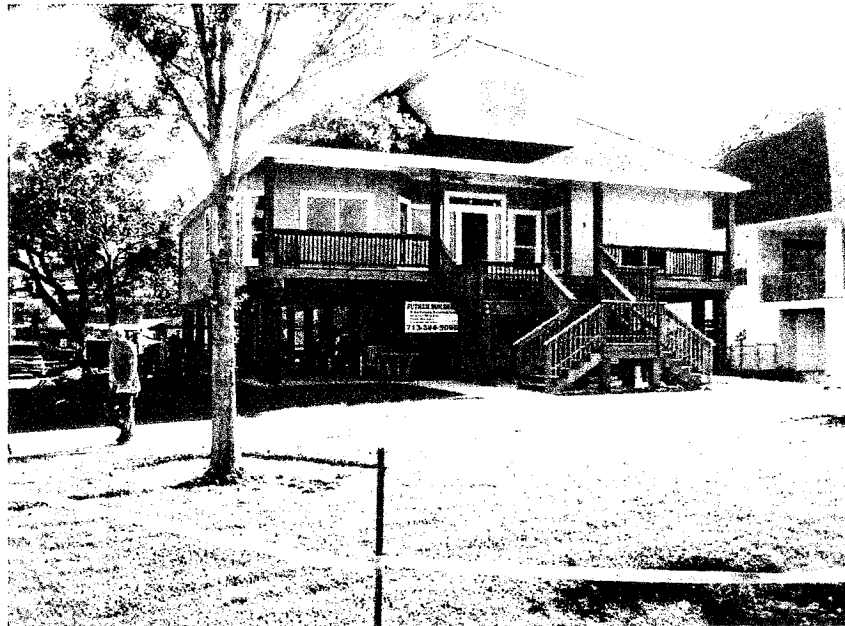
FRONT VIEW (5/23/10)

If using the Elevation Certificate to obtain NFIP flood insurance, affix at least two building photographs below according to the instructions for Item A6. Identify all photographs with: date taken; "Front View" and "Rear View"; and, if required, "Right Side View" and "Left Side View." If submitting more photographs than will fit on this page, use the Continuation Page on the reverse.