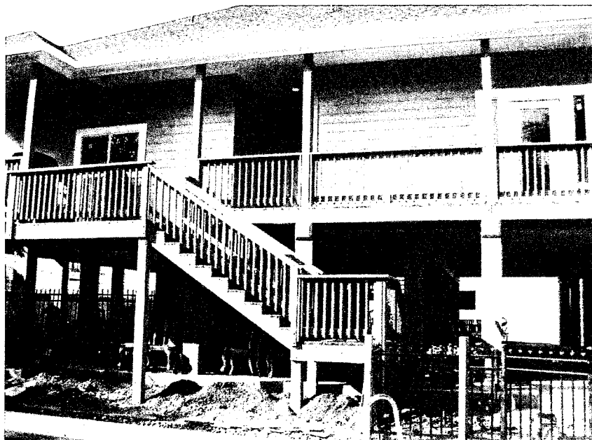
REAR VIEW (5/24/10)