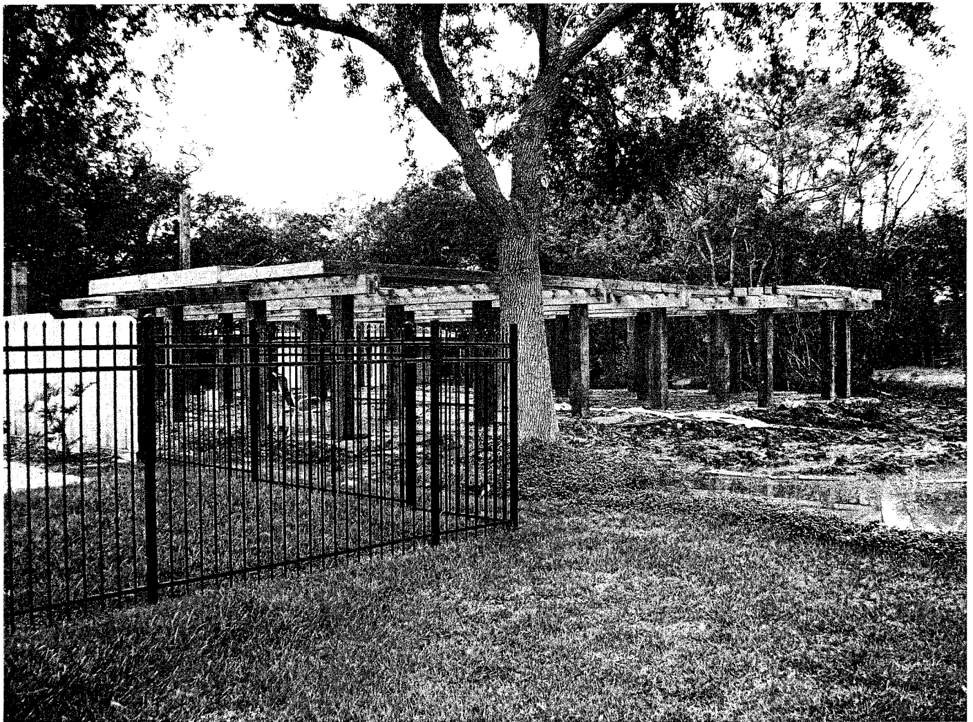
Side View of Residence