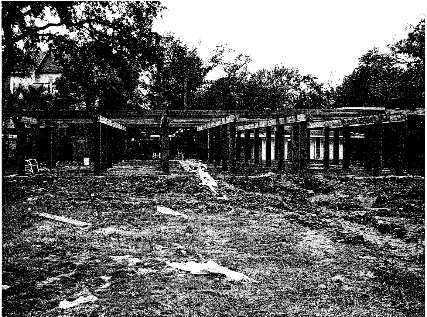
Front View of Residence

If using the Elevation Certificate to obtain NFIP flood insurance, affix at least two building photographs below according to the instructions for Item A6. Identify all photographs with: date taken; "Front View" and "Rear View"; and, if required, "Right Side View" and "Left Side View." If submitting more photographs than will fit on this page, use the Continuation Page, following.