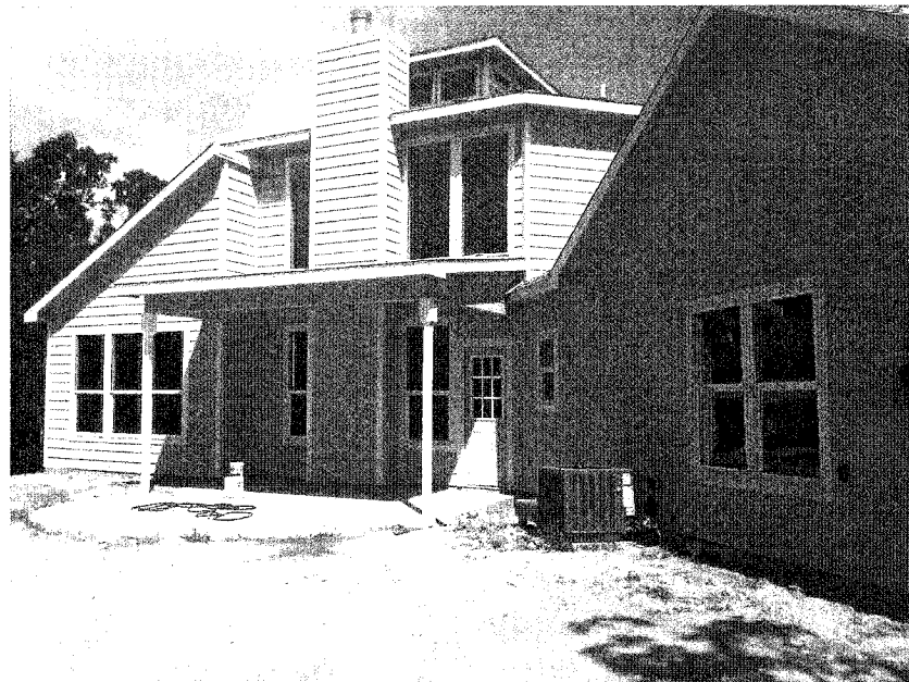
REAR VIEW (6/16/10)