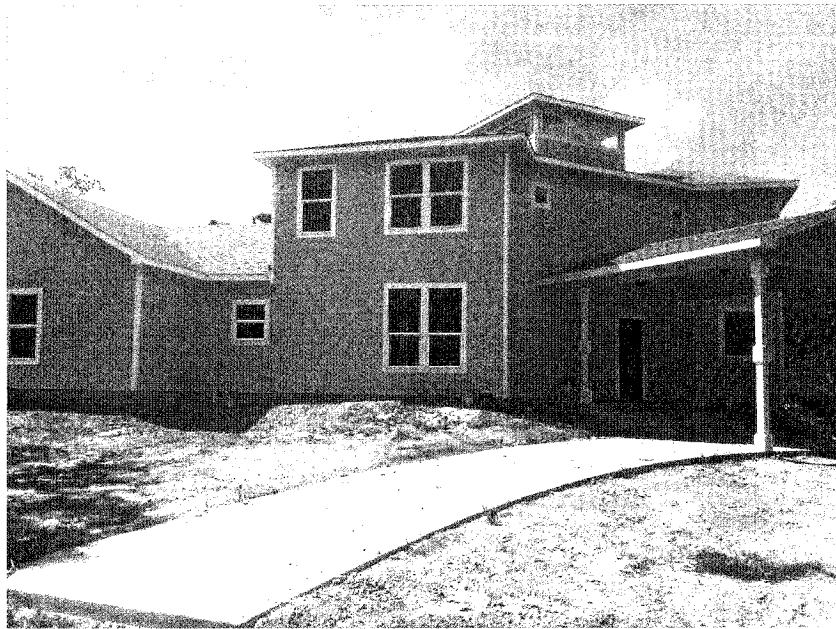
FRONT VIEW (6/16/10)

If using the Elevation Certificate to obtain NFIP flood insurance, affix at least two building photographs below according to the instructions for Item A6. Identify all photographs with: date taken; "Front View" and "Rear View"; and, if required, "Right Side View" and "Left Side View." If submitting more photographs than will fit on this page, use the Continuation Page on the reverse.