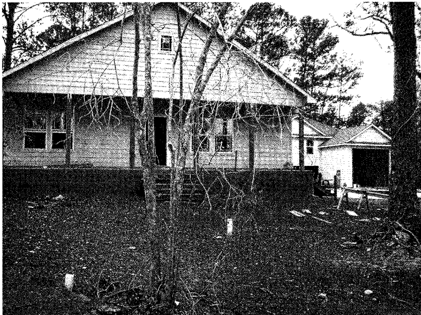
REAR VIEW (7/21/09)