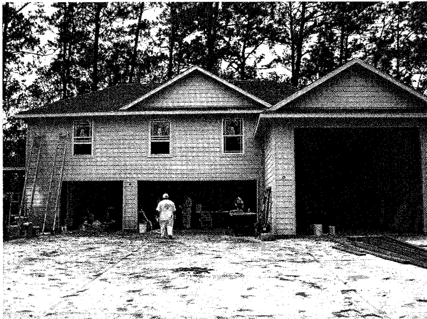
FRONT VIEW (8/15/09)

If using the Elevation Certificate to obtain NFIP flood insurance, affix at least two building photographs below according to the instructions for Item A6. Identify all photographs with: date taken; "Front View" and "Rear View"; and, if required, "Right Side View" and "Left Side View." If submitting more photographs than will fit on this page, use the Continuation Page on the reverse.