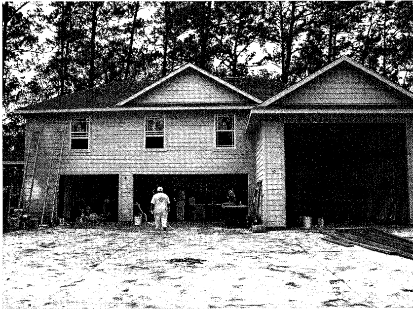
FRONT VIEW (8/15/09)

If using the Elevation Certificate to obtain NFIP flood insurance, affix at least two building photographs below according to the instructions for Item A6. Identify all photographs with: date taken; "Front View" and "Rear View"; and, if required, "Right Side View" and "Left Side View." If submitting more photographs than will fit on this page, use the Continuation Page on the reverse.