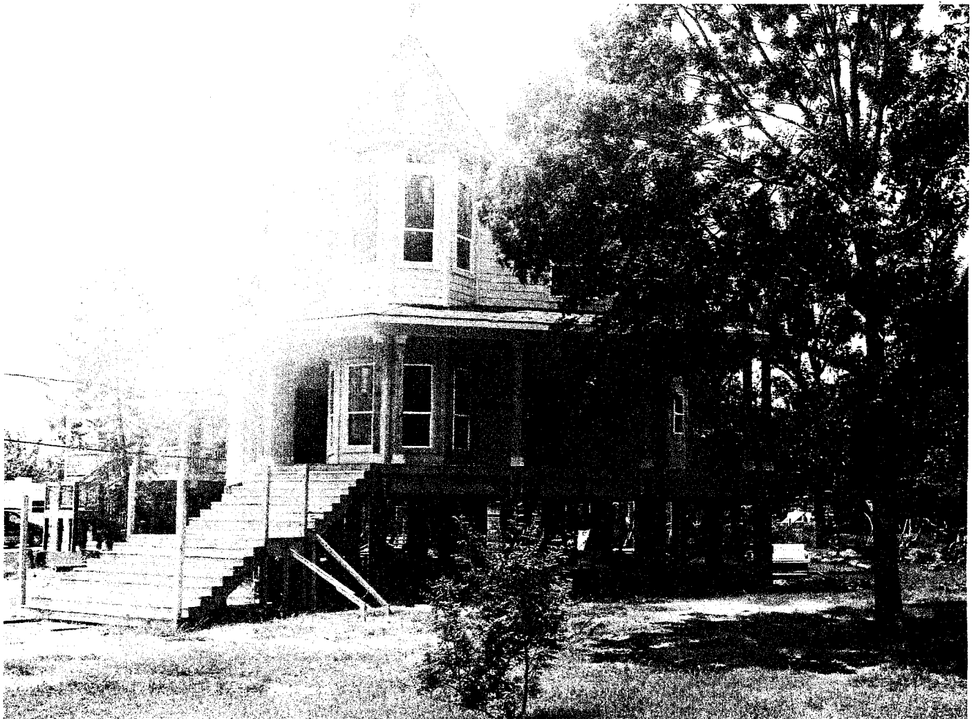
FRONT VIEW OF RESIDENCE