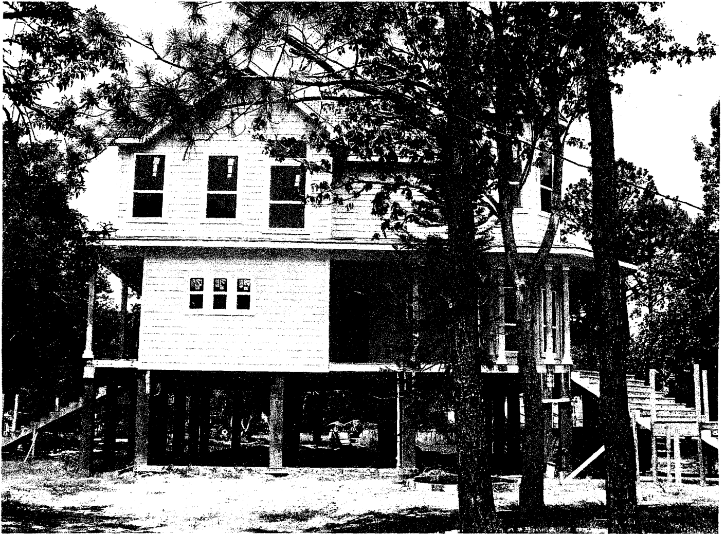
LEFT SIDE VIEW OF RESIDENCE