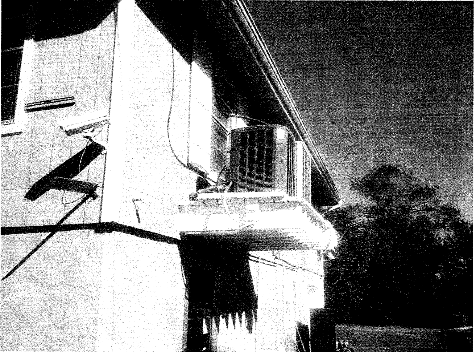
A/C UNIT ON FRAME PLATFORM