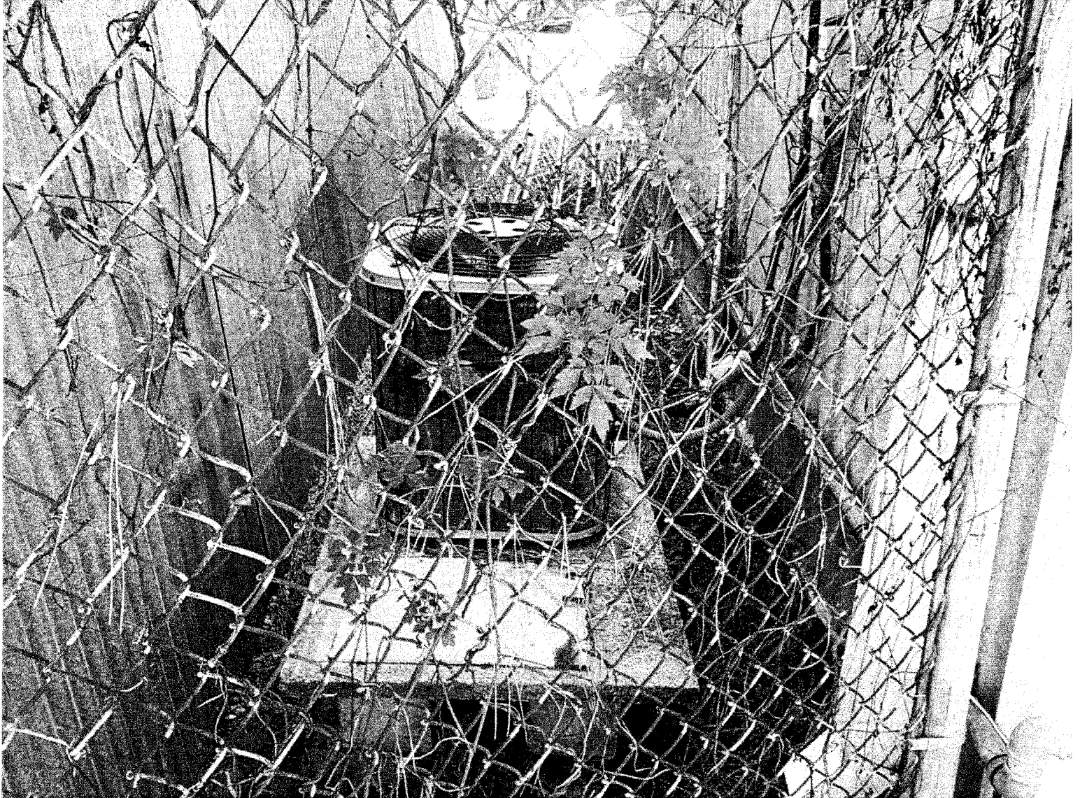
A/C UNIT ON CONCRETE BLOCKS