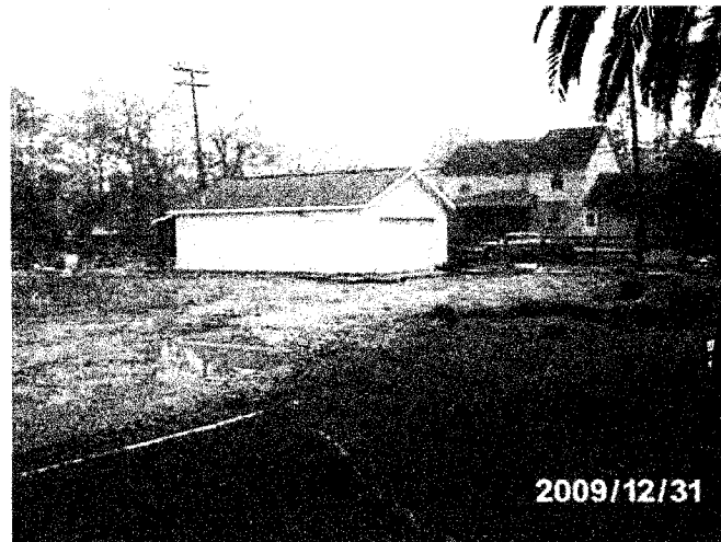
FRONT VIEW (From Northwest Corner)