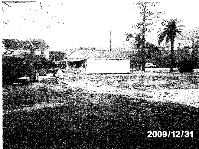
FRONT VIEW (From Northeast Corner)

If using the Elevation Certificate to obtain NFIP flood insurance, affix at least two building photographs below according to the instructions for Item A6. Identify all photographs with: date taken; "Front View" and "Rear View"; and, if required, "Right Side View" and "Left Side View." If submitting more photographs than will fit on this page, use the Continuation Page, following.